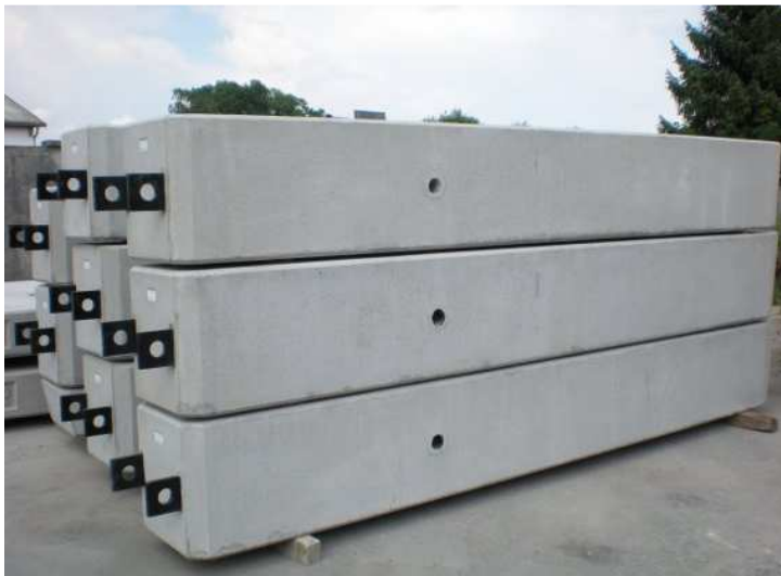
Picture: MDT counter jip ballast CBU 3070